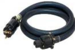
Evolution Power 1.8M 15A/125V 10A/250V 13A/250V AC

Furutech's Evolution Series was awarded The Absolute Sound Editors' Choice Award in both 2007 and 2008