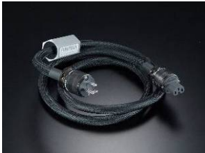
Power Connectors: FI-25M(R)