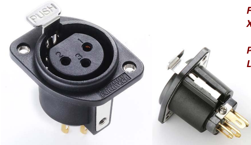
Furutech FT-786F(G) XLR Female Sockets

Premier Performance and Legendary Build Quality