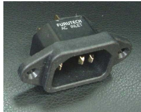
AC Inlet (R) Rhodium Plated