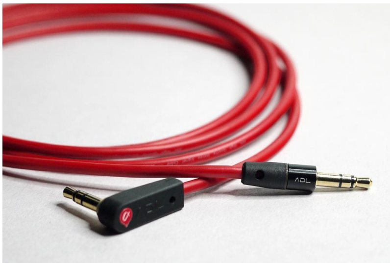
iHP-35B-1.3M / 3.0M

High-quality headphones are a must in the age of personal, portable electronics, but many are supplied with inferior throw-away cables. Headphone listening is an intimate experience and enthusiasts always want better sound. ADL's iHP-35 cables accomplish that in spectacular fashion with headphones, players and headphone amplifiers.