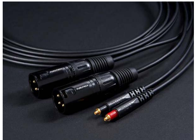
iHP-35ML-XLR-1.3M / 3.0M by request