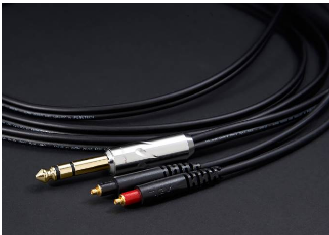
iHP-35ML-1.3M / 3.0M

High-quality headphones are a must in the age of personal, portable electronics, but many are supplied with inferior throw-away cables. Headphone listening is an intimate experience and enthusiasts always want better sound. ADL's iHP-35 cables accomplish that in spectacular fashion with headphones, players and headphone amplifiers. The iHP-35 series is available in five versions to make the perfect connection!