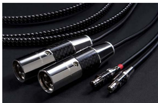
iHP-35Hx-XLR-1.3M / 3.0M by request