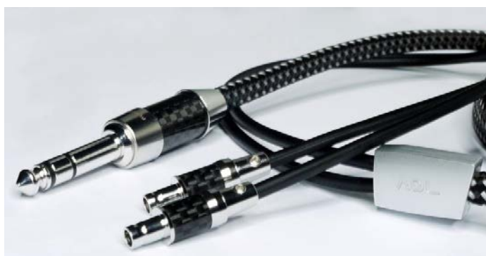
iHP-35Hx-1.3M / 3.0M

High-quality headphones are a must in the age of personal, portable electronics, but many are supplied with inferior throw-away cables. Headphone listening is an intimate experience and enthusiasts always want better sound. ADL's iHP-35 cables accomplish that in spectacular fashion with headphones, players and headphone amplifiers. The iHP-35 series is available in five versions to make the perfect connection!