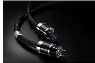
Piezo Powerflux -18E

May Be the Most Sophisticated Power Cord and Connectors in the World