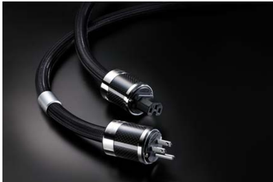
Piezo Powerflux -18

May Be the Most Sophisticated Power Cord and Connectors in the World